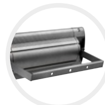
Back side S1+ bracket