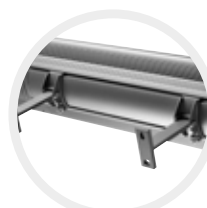
Rear S3 T-mount

* Attention: increased starting current!