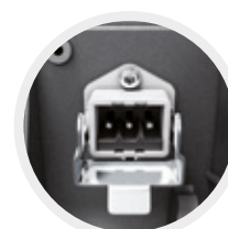
Plug-in cable S1+ and S3