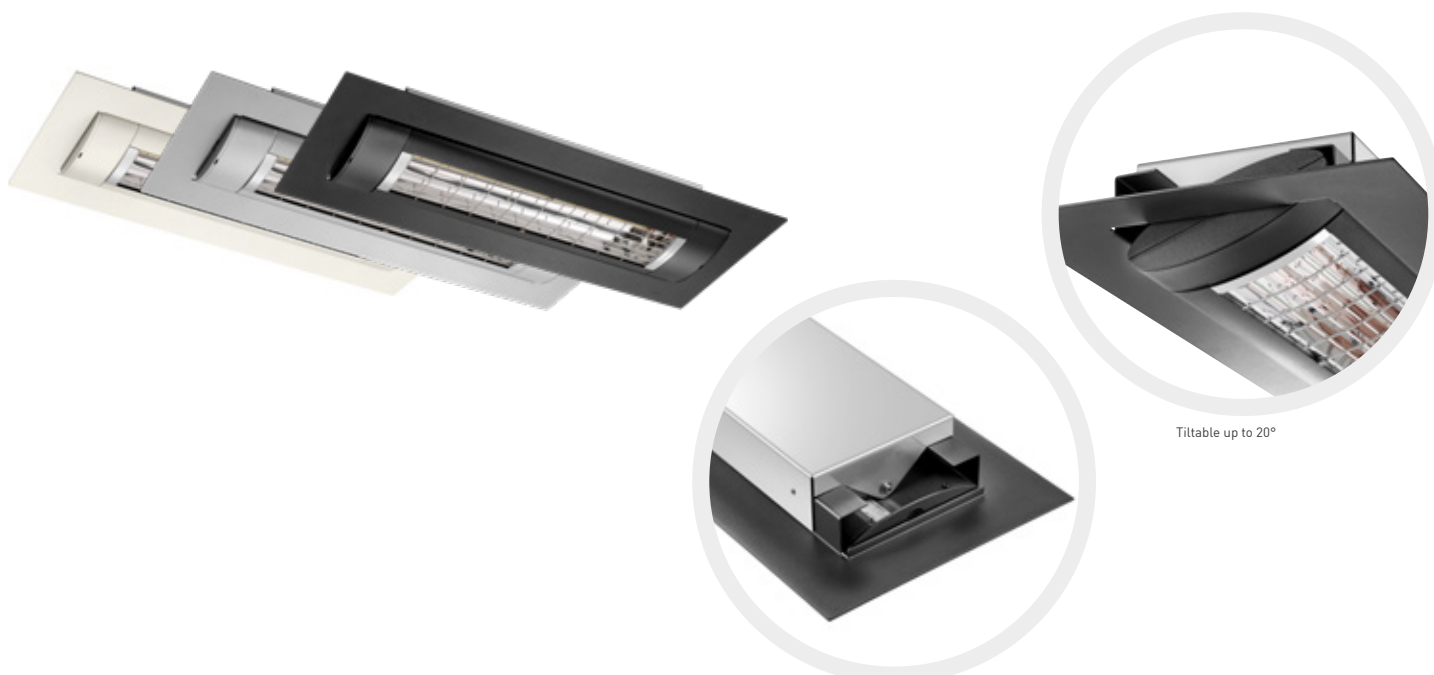
Tilttable up to 20°

W: white T: titanium NA: nano anthracite